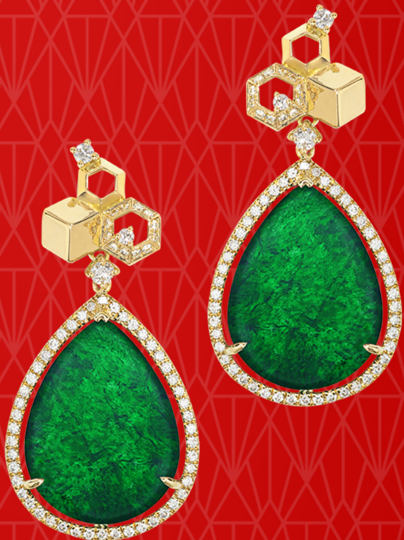
1.60ct and 1.77ct Mui Fa Lok jadeite earrings paired with 0.91ct round brilliant diamonds, set in 18k yellow gold RM 30,059