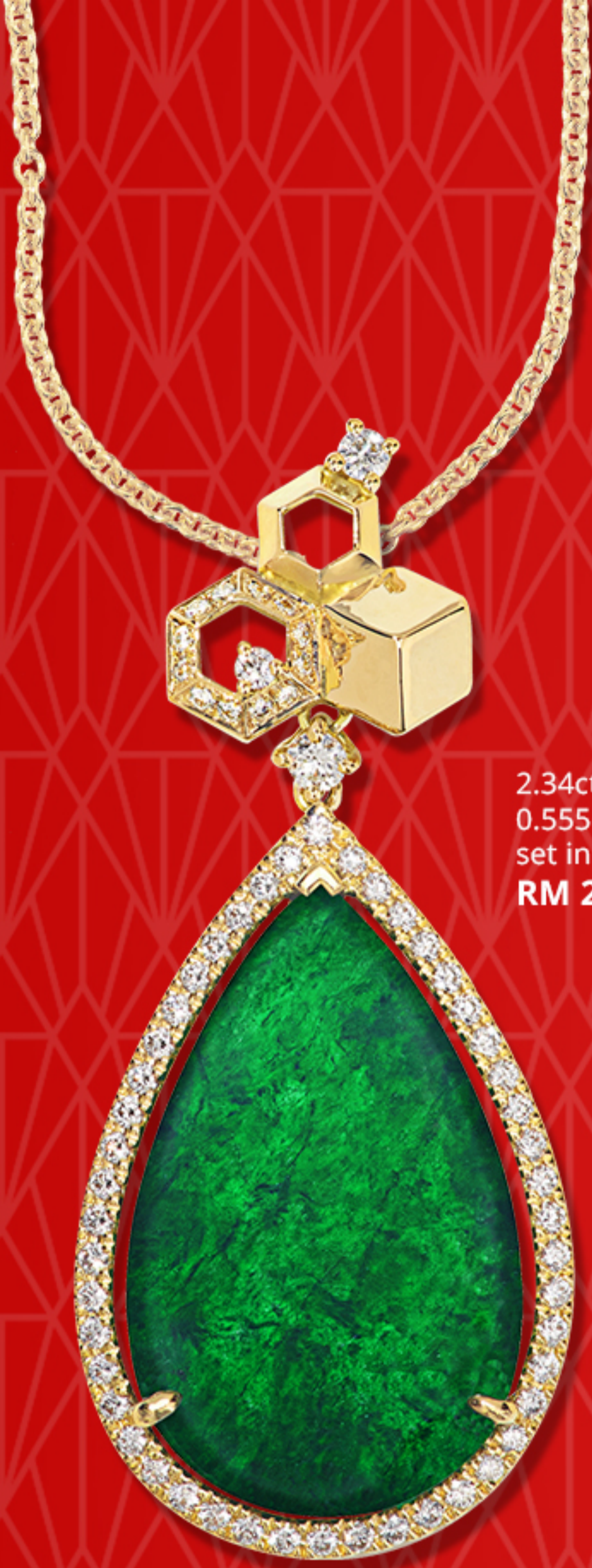
2.34ct Mui Fa Lok pendant paired with 0.555ct round brilliant diamonds and chain, set in 18k yellow gold RM 21,989